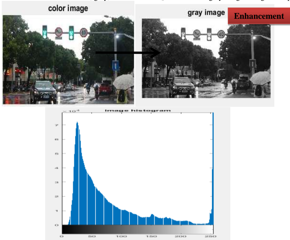
Fig -3 Imagine Enhancement Processing diagram